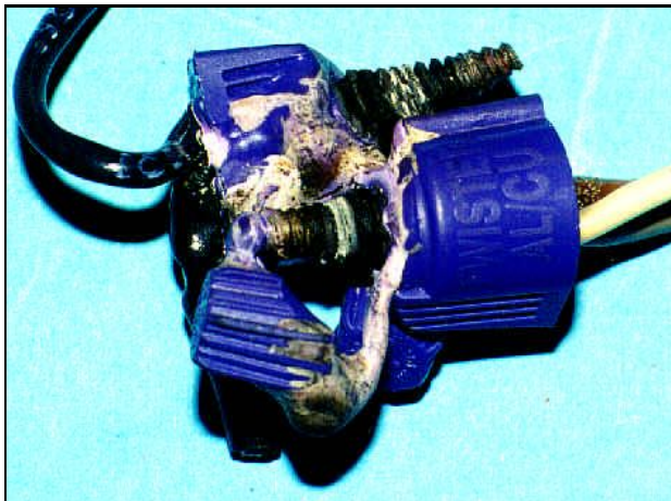
A. THESE TWO FAILED SPLICES ARE ADHERED TOGETHER BY THE MELTED PLASTIC SHELLS

Additionally, field burnouts have now been reported with the Ideal #65 connectors in their rated applications. With CPSC skeptical (and requesting that UL withdraw its listing), the manufacturer initially agreeing that the connector is not for the pigtail retrofit application, independent tests clearly demonstrating poor performance, and field failures reported, the use of the Ideal #65 "Twister" connector for the pigtail application is definitely not recommended.