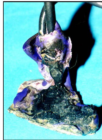
B. SEVERE FAILURE, PLASTIC SHELL MELTED AND CHARRED. THE CHARRING INDICATES THAT IT HAD PROBABLY IGNITED.